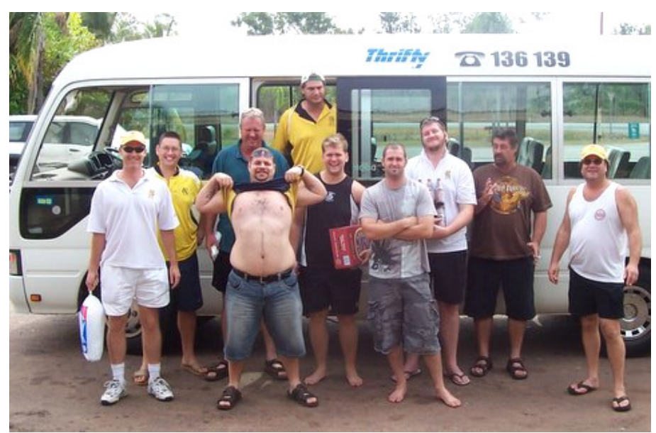
"Gutsy effort that Tigers!"