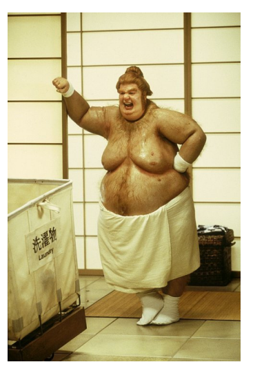
THE END. NO MORE. ALL GONE.