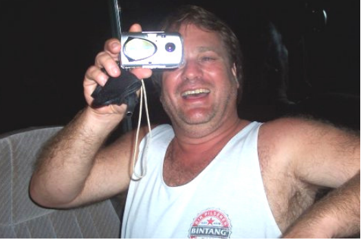
"Nightcliff D-Grade – still undefeated beyond the Berrimah line"