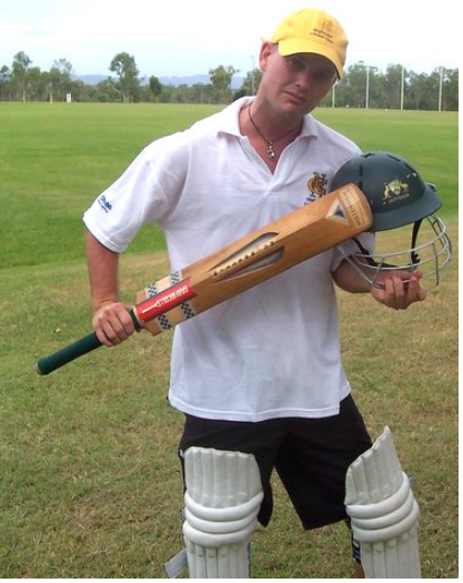
"Look kids, Big Ben..."